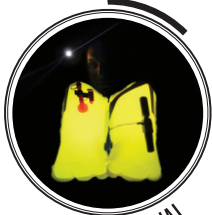
LUME-ON™ LIFEJACKET ILLUMINATION LIGHTS FITTED