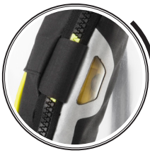
QUICK BURST ZIP & INDICATOR WINDOW