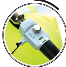
PRO SENSOR OR MK5i FIRING HEAD OPTIONS