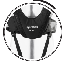
DOUBLE CROTCH STRAPS