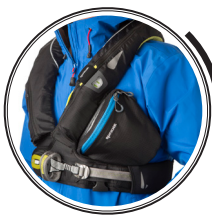
CHEST PACK ATTACHMENT POINTS