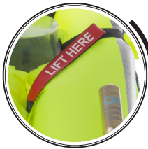
HIGHLY VISIBLE RED LIFTING STRAP