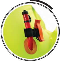
ORAL INFLATION TUBE & WHISTLE