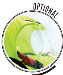
OPTIONAL SPRAY HOOD