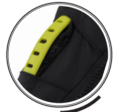
MANUAL ACTIVATION HANDLE