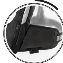
ID / ASSET TRACK POCKET