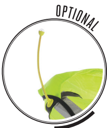
OPTIONAL PYLON™ LIFEJACKET LIGHT