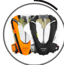
EXTRA DURABLE COVER MATERIALS