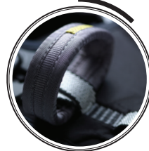
SAFETY LINE ATTACHMENT POINT