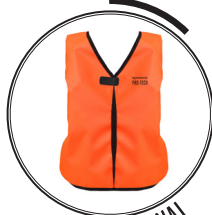
PRO-TECH PROTECTIVE COVER