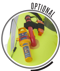
OPTIONAL AIS MOB1 UNIT